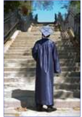
The real work begins after you graduate.